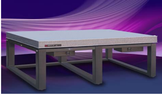
Tables over 5'