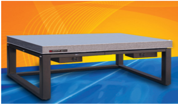
Tables 5' or less